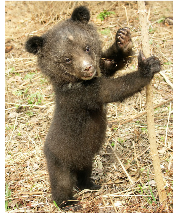
cub (baby bear)