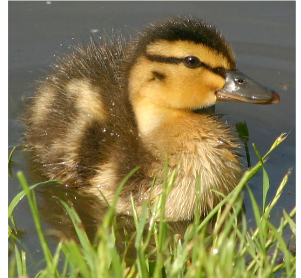
duckling (baby duck)

Note: some sources refer to a female duck as a “hen”, but most commonly, a female duck is simply called a “duck”.