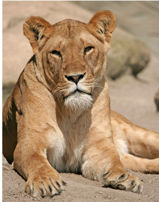
lioness (female lion)