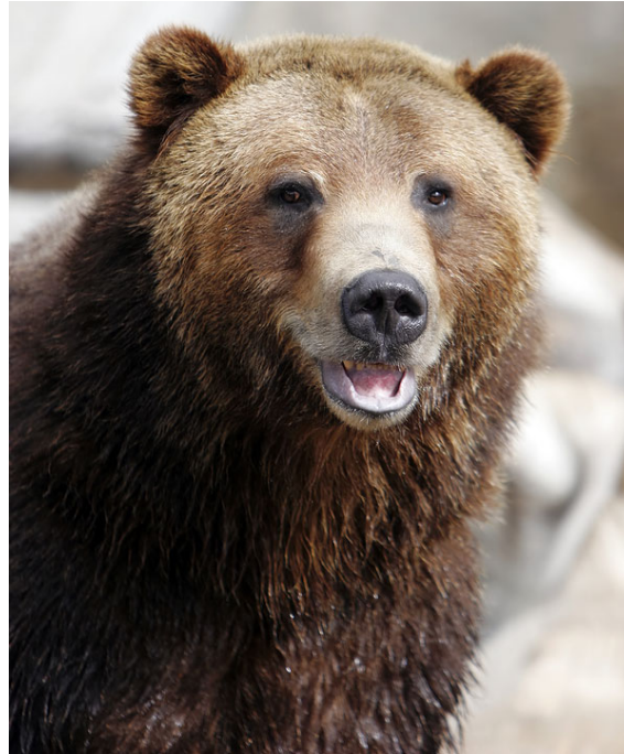
sow (female bear)