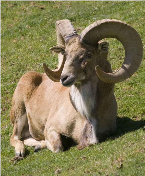
ram (male sheep)