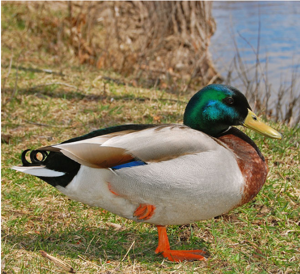
drake (male duck)