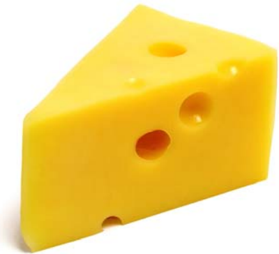
butter and cheese