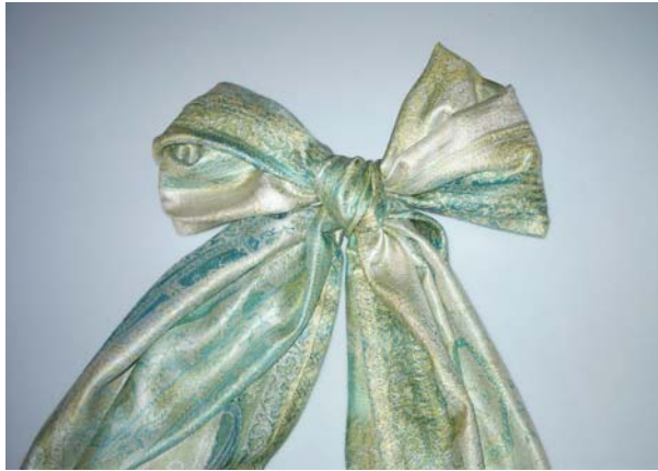
A finished bow!

Instructions: Print on cardstock, laminate, and cut out cards.