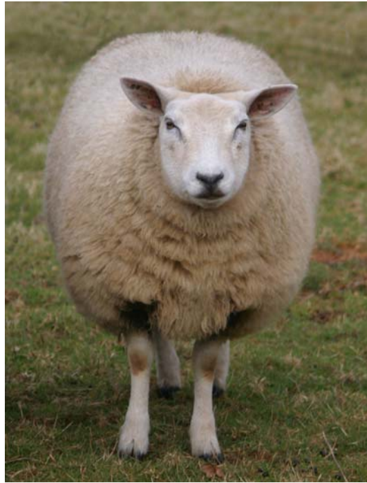
ewe (female sheep)