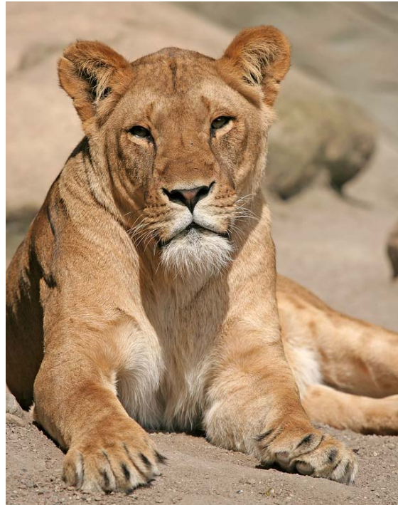
lioness (female lion)