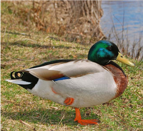
drake (male duck)