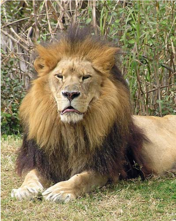
lion (male lion)