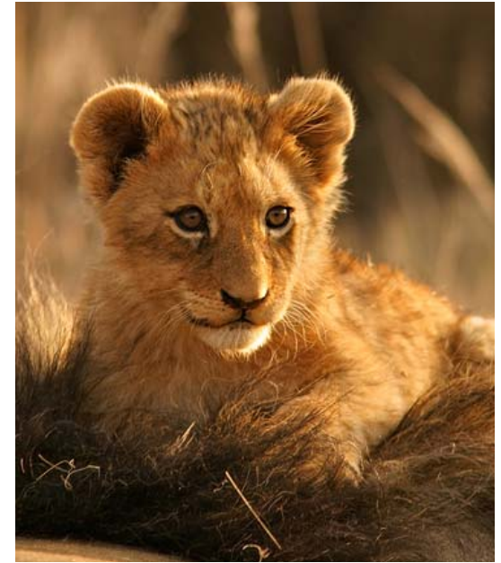
cub (baby lion)

Instructions: print on cardstock and laminate. Cut cards out. Show child how to match the cards to make the animal families.