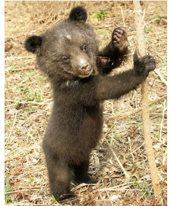
cub (baby bear)