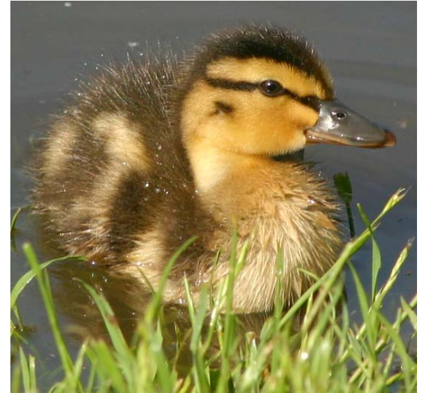
duckling (baby duck)

Note: some sources refer to a female duck as a “hen”, but most commonly, a female duck is simply called a “duck”.