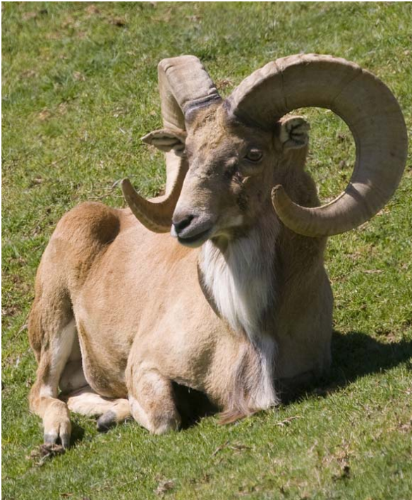
ram (male sheep)