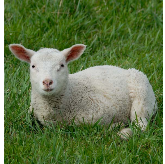
lamb (baby sheep)